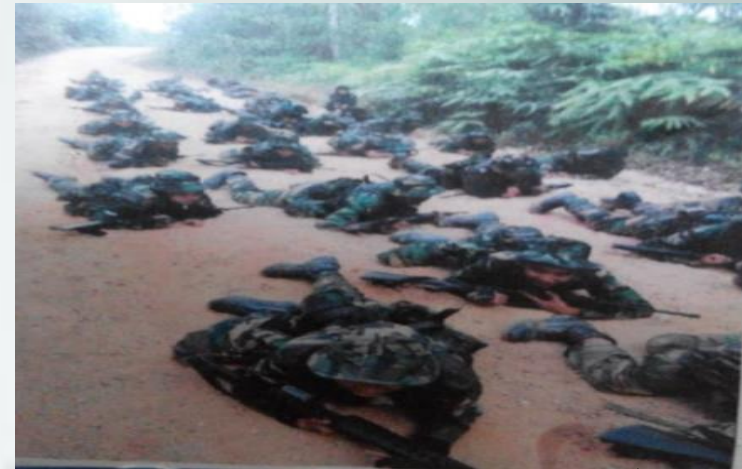
Cadet Officer, UTM PALAPES Darat