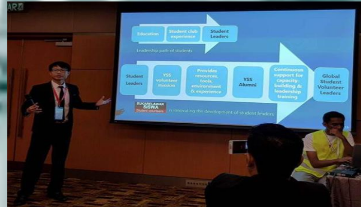
Active Alumni, Yayasan Sukarelawan Siswa