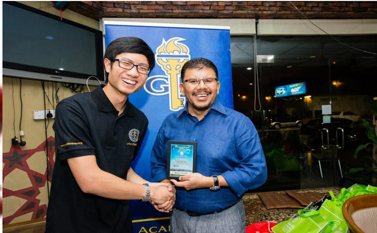
President, Golden Key International Honour Society UTM Student Chapter