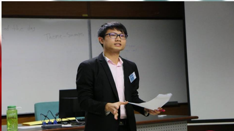
Vice President of Public Relations, UTM ACES Toastmasters Club