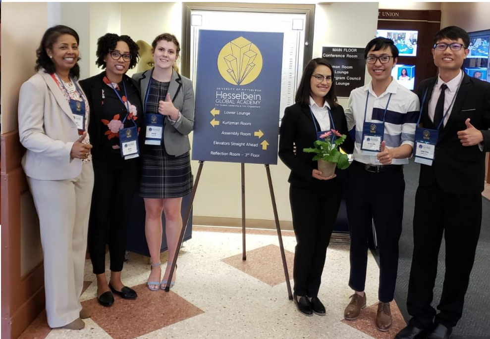
Frances Hesselbein 27 July at 02:46

1. Leadership is a matter of how to be, not how to do. 2. To serve is to live.